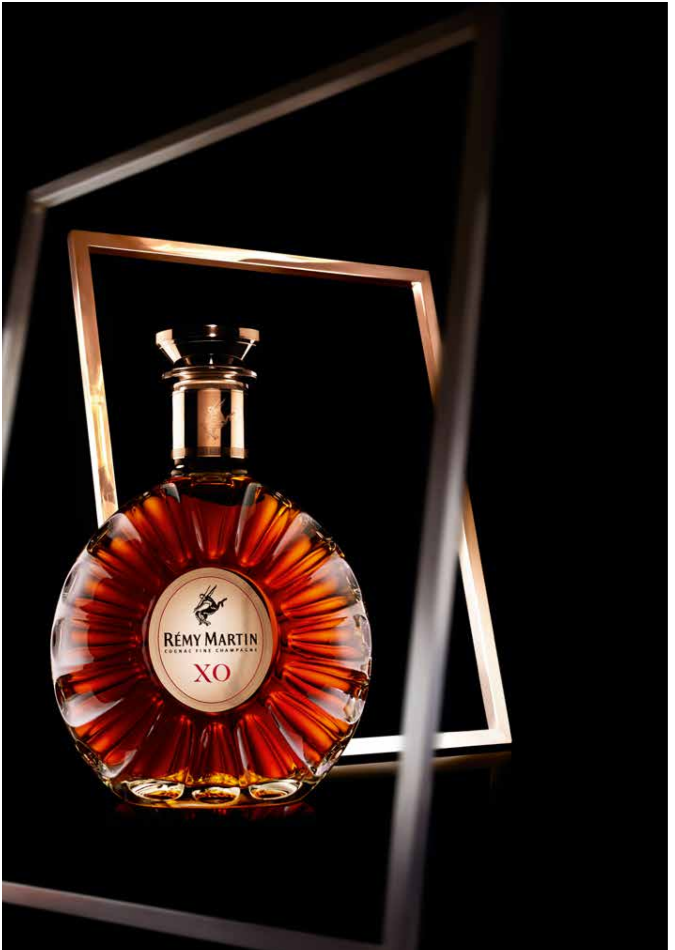
New Rémy Martin XO bottle.