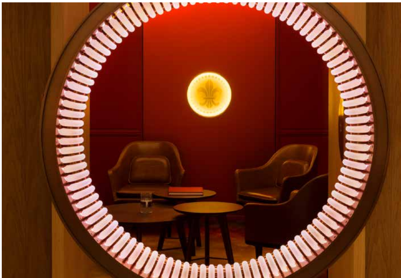
New LOUIS XIII boutique in Beijing, China.