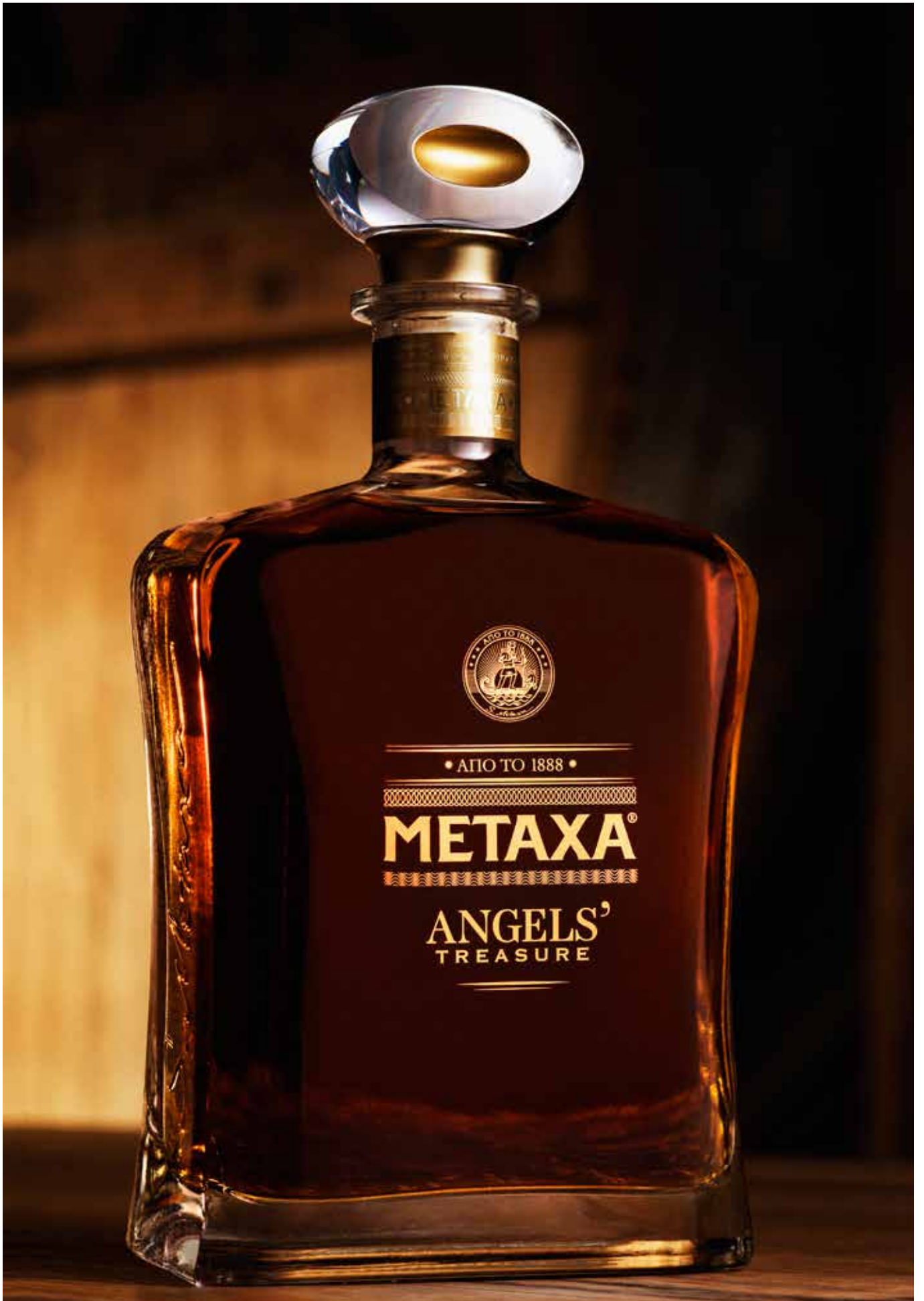
METAXA ANGELS' TREASURE.