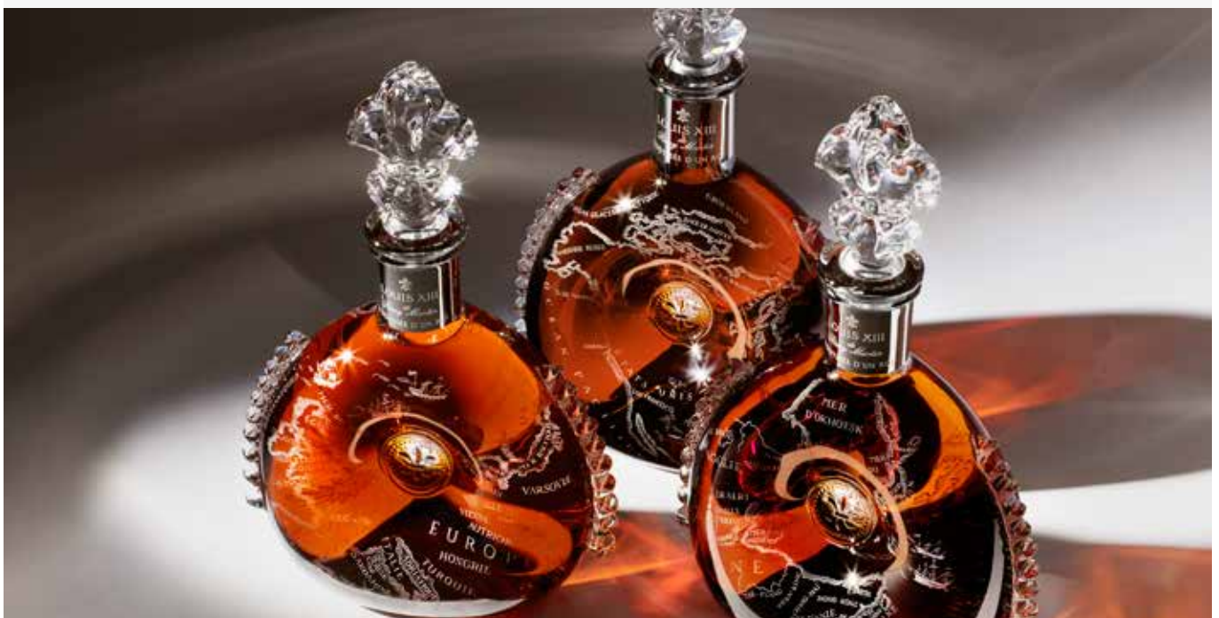
Three LOUIS XIII decanters engraved for L'Odysée d'un Roi project.

The net debt to EBITDA ratio once again showed an improvement at end-September 2016, standing at 2.16 (compared with 2.29 at end-March 2016 and 2.53 at end-September 2015) despite the usual unfavourable seasonality of the first half of the year.