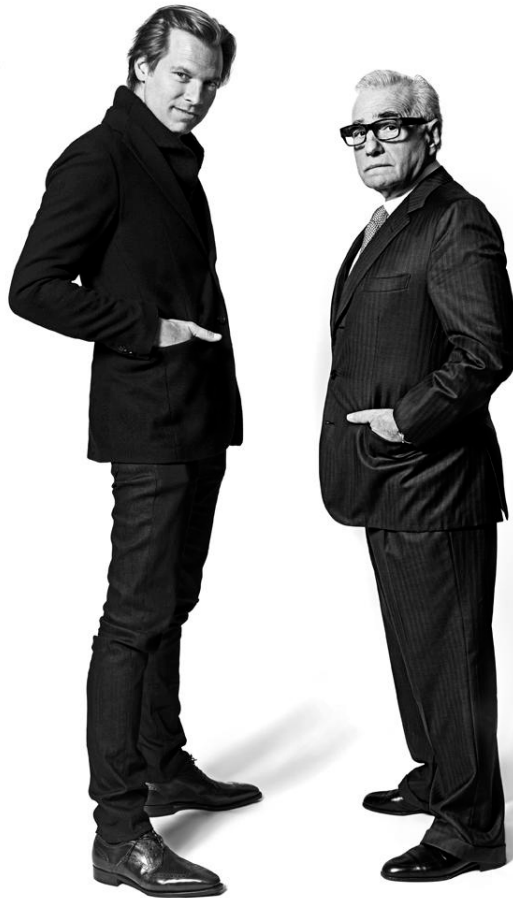
Ludovic du Plessis, LOUIS XIII and Martin Scorsese, THE FILM FOUNDATION

“We’re grateful to LOUIS XIII for its support of THE FILM FOUNDATION,” said Martin Scorsese. “The foundation’s film preservation work protects the cinematic heritage that we all share. The partnership with Louis XIII and L’ODYSSÉE D’UN ROI, is an excellent way to highlight the foundation’s preservation, education, and exhibition programs. No matter where or when a film was made, a century ago or a decade ago, the foundation is committed to ensuring that all films survive to be seen by future generations.”